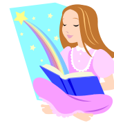
More Long / Short Vowel Words