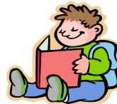
Long / Short Vowel Words