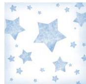
Starfall Learn to Read