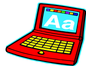
Short Vowel Words