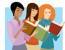
RIF Read Aloud