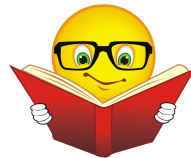
High Frequency Words